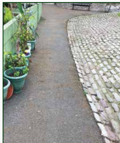
► 1 month after treatment