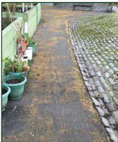
► A few hours after treatment